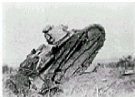
U.S. Army Tank 1918

On September 12, 1918 , the American Expeditionary Forces under commander in chief General John J. Pershing launched their first major offensive in Europe as an independent army. In planning the assault, the United States military had a new weapon, the armored tank. General Pershing created the U.S. Tank Corps, committed for use in support of the Infantry, under the command of the brilliant and aggressive young lieutenant, George S. Patton. Patton had been training the tank brigades throughout the summer of 1918. In the St. Mihiel offensive, the American Expeditionary Forces utilized with resounding success the armored fighting tank brigades as a substitute for the cavalry.