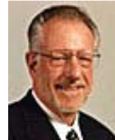
Oscar B. Goodman City of Las Vegas