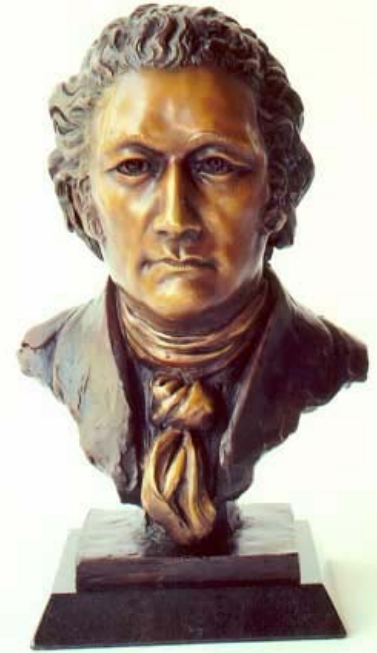
Alexander Hamilton January 11, 1755—July 12, 1804

In framing a government which is to be administered by men over men the great difficulty lies in this: You must first enable the government to control the governed, and in the next place, oblige it to control itself.