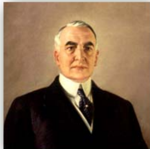
President Warren G. Harding 1865 — 1923