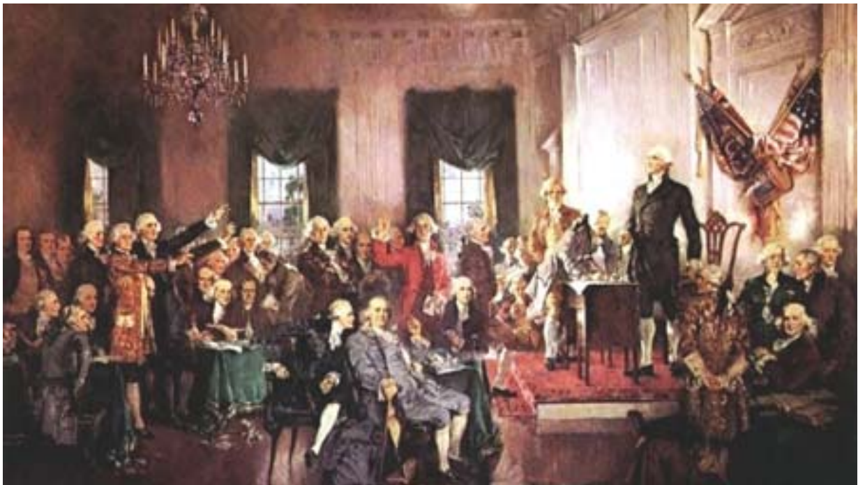
Scene at the signing of the Constitution of the United States