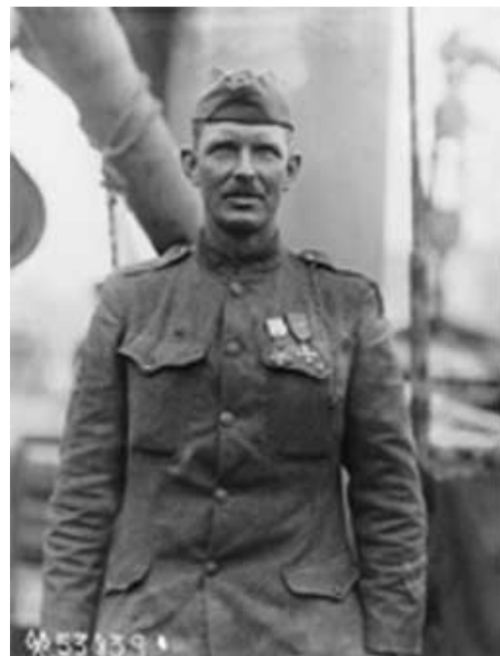
Sergeant Alvin Cullum York

come upon his return to the United States in 1919 and was awarded the Congressional Medal of Honor, the nation's highest military decoration. York died in 1964.