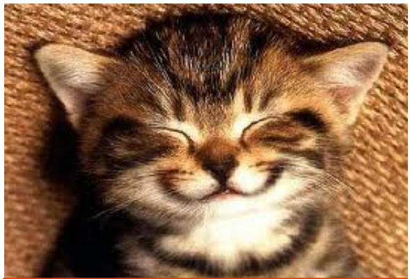
This is National Smile Week!