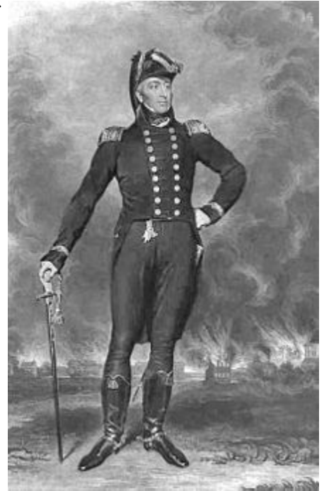
Rear Admiral George Cockburn with Washington burning in the background.

As a footnote, the action of the British army in Washington City was condemned by the people of England when they heard of it.