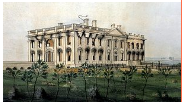
The burned out President's House