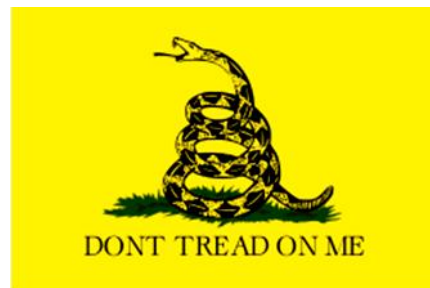
The Gadsden Flag 1775

On Sunday June 8, 2014, two idiots, a husband and wife, who harbored anti-government beliefs, went on a deadly shooting rampage in Las Vegas NV killing two Metro police officers and one civilian. They left a swastika and a yellow Gadsden flag on the body of one of the police officers they killed. It has recently been used as a symbol by the Tea Party.