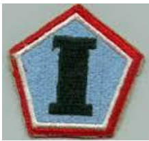
1st Army Group Insignia

Knight can be reached at: knightallen702@yahoo.com