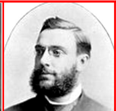
Thomas A. Watson